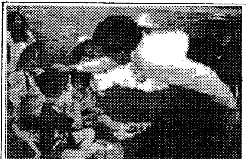
Children enjoy stories told by Mary Dance at Plantation Day 1993.

☞ July - "Heritage Krafts for Kids" , a series of four weekly craft programs at Magnolia Grange for children, grades 2 - 5. Sign up your child or grandchild! Call for more information (796-1479).