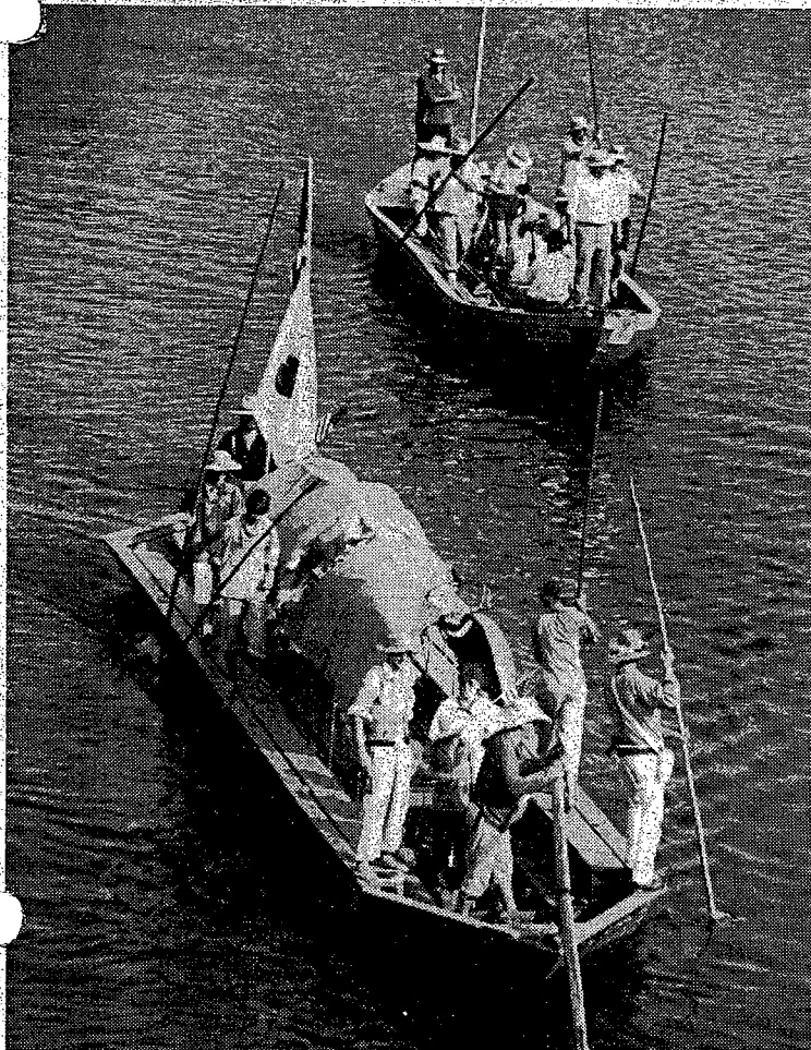
The Lord Chesterfield bateau (pictured at front) "poles" its way through the water on a recent excursion. It has represented the county and the historical society in

QUARTERLY MEETING Sunday, October 25 3:00 in the afternoon